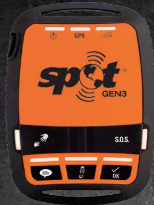
Pictured at actual size. 8.72 x 6.5cm.

SPOT GEN3 gives you a critical, life-saving line of communication when you travel beyond the boundaries of mobile coverage. SPOT GEN3 lets family and friends know you're OK, or if the worst should happen, sends emergency responders your GPS location - all with the push of a button. Add this rugged, pocket sized device to your essential gear and stay connected wherever you roam.